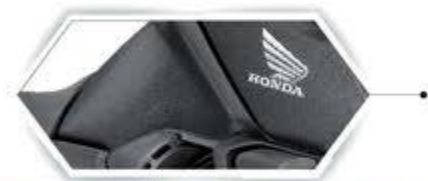
MATTE AXIS GRAY METALLIC