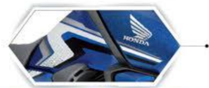
MATTE MARVEL BLUE METALLIC