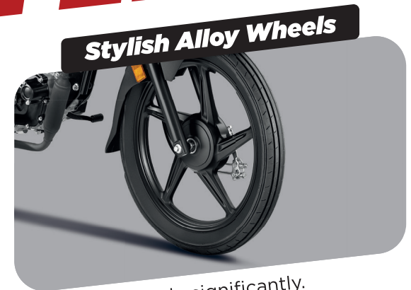
Stylish Alloy Wheels