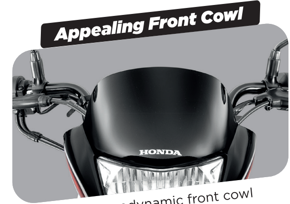
Appealing Front Cowl

Beautiful tank and side graphics increase your shine.