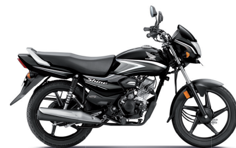
Black With Grey

BOOK ONLINE NOW! www.honda2wheelersindia.com