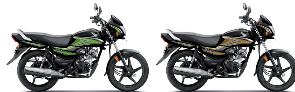
Black With Green